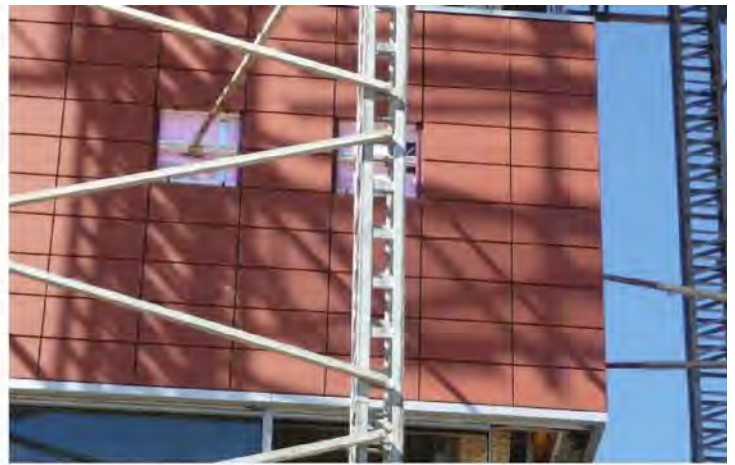
The Kerry America corporate headquarters in Beloit, Wisconsin, won the International Union of Bricklayers and Allied Craftworkers (BAC) Craft Award for best terra cotta rainscreen wall.

The most practical of these three options is neutralizing the water's driving force by introducing adequate air behind the cladding to eliminate pressure differentials across it. If done