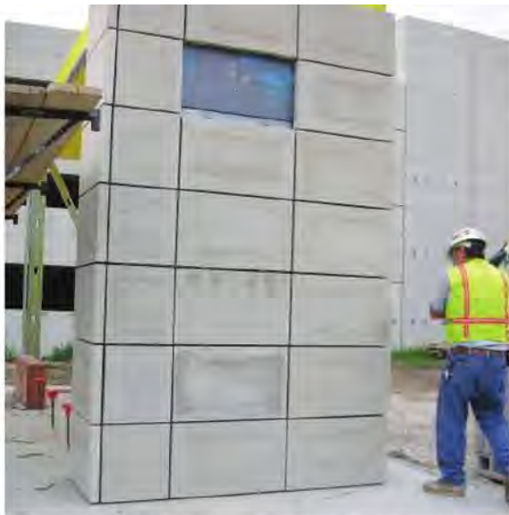
With a large project and new, open-jointed rainscreen wall technology, the team used an oversized mockup for the Johnson Controls building (also pictured on page 24).