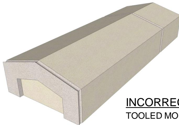
INCORRECT TOOLED MORTAR JOINT